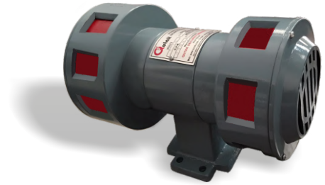
MODEL NO. : QT - 3.25 KM ( CL )